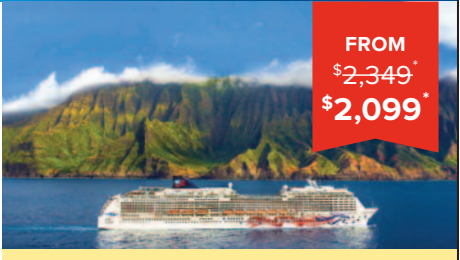
FREE INTERNET FREE BEVERAGE PACKAGE

Enjoy 7 nights aboard Holland America Line's ms Westerdam and 4 nights on land. You'll cruise the Gulf of Alaska and the Inside Passage—a sea lane teeming with marine wildlife, where you'll pass glaciers, mountains, and lush forests, with stops in Ketchikan, Skagway, and Glacier Bay. On land, you'll go deep into Denali National Park, tour Anchorage, and see the Alaska Wildlife Conservation Center.