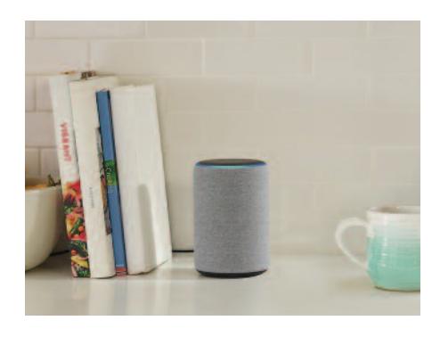
Many smart lighting systems can be controlled through smart speakers like the Amazon Echo shown here.

At its heart, smart lighting covers a range of bulbs, controls and lighting systems programmable through an app on a mobile device, computer or smart speaker. Smart lighting can do more than just turn on and off at the right time. Some smart lighting systems can dim at various times. Some can be connected to a sensor or motion detector so that a light goes on when a door is opened, or someone enters a room. Some smart lighting systems can change color so you can set up a holiday light show indoors or outdoors. It can also be practical, providing lighting that matches sunlight during the day and is more relaxing in the evening. You may even be able to play music directly from the bulb!