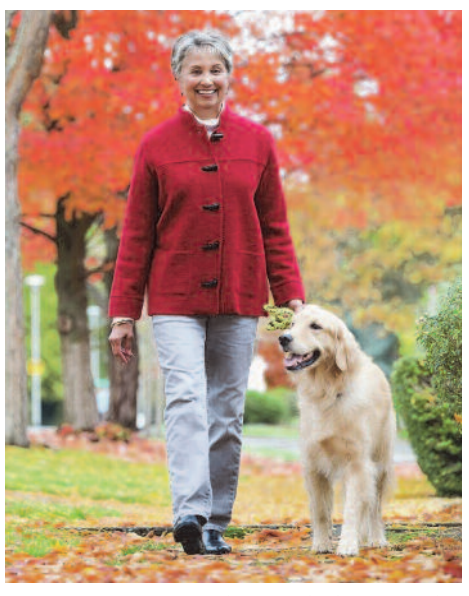
Chinese herbs provide fast relief of leg and feet tingling, burning and numbness. They do this by improving the flow of blood, nutrients and oxygen to your legs and feet to repair damaged nerves.

Now you can get a good night's sleep - peace-